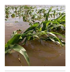
A corn field is submerged in flood water near Oakville, Iowa, on June 16, 2008.

So everybody was already expecting a smaller corn crop this year. Then the Corn Belt flooded.